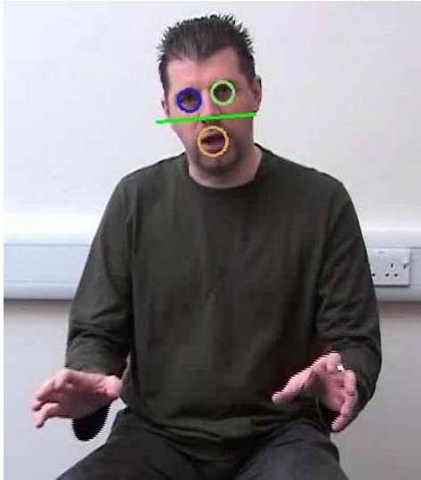
Figure 2: The Head tracker in action