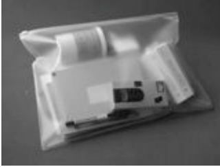
Figure 1. Domestic Probe Pack

The practical work of designing, constructing and assembling the Domestic Probes Pack started at the very beginning of the project and had continued throughout the planning, recruitment and selection phases. The group had come to an agreement that they would include a “ PROBE CAMERA ” (see figure 2) - a repackaged disposable camera.