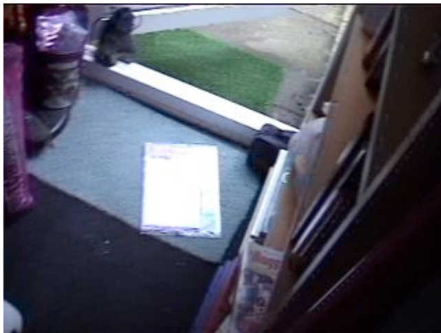
Display 1. The porch: a shared and known in common collection point.

Mail is typically collected from some central point, whether that point is located at the front door, in the grounds outside a house, or from a post box located elsewhere in an apartment block. Depending on the contingencies of location, the collection point for mail is one at which displaying may go on. The displaying simply consists of this: seeing that mail has arrived. Mail may be collected by any household member - in some homes the same person might do the job all the time, whereas in others it simply depends on who gets up first or who is home first. The point to note here is that the collection of mail by household members is not coordinated through the nomination of a 'collector' but through the public availability of a shared and known in common collection point and, contingently, on the visibility of mail. Any household or group member can collect the mail (not anyone can open it, however).