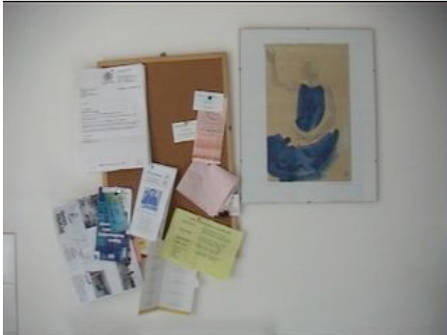
Display 7. Placing mail of short-term relevance.

organized for storage and retrieval: e.g. in a bureau, drawer, or filing cabinet.