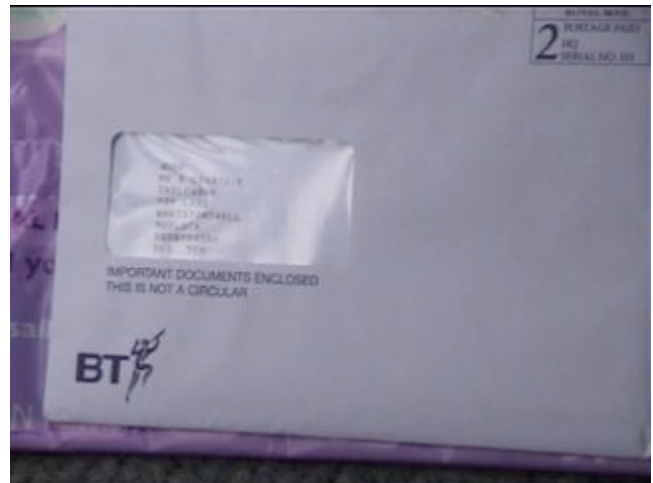
Display 2. Displaying and announcing the practical character of mail (phone bill arrives).

letters from school concerning children). The opening of mail is not necessarily ordered by recipient name on an envelope, then, but by entitlement to open such mail. The point here is that there is often a visibility to mail that displays and so announces its practical character: what it is about, who it is from, and who may thus be an appropriate recipient and so be entitled to open it. This is often conveyed by a logo, organizational stamp, postmark, or the printing of the sender's name on the outside of the envelope.