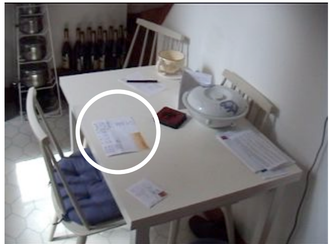
Display 5. Displaying mail for external use (electric bill)

Opened mail that has been viewed is also displayed according to its relevance to practical action. The display of opened and viewed mail is ordered by the temporal flow of sorting work and the organization of mail into discrete groupings that reflect the actions required at-a-glance. Again, these displays are contingent on the material arrangements of domestic space. Mail for external use, such as they payment of bills, is placed in a location that reflects the need for external action: e.g. on a desk in the hallway, at the front of the kitchen table, or next to a bag that is routinely taken along when a person leaves the house.