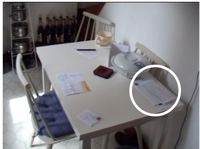
Display 6. Placing mail pending further action.

Mail for internal use is displayed in an alternate location: e.g. on top of the stereo, on top of the bureau, or at the back of the kitchen table. While particular locations vary from home to home, this latter arrangement is effectively a 'pending pile'. It may contain mail for external use if it is not of immediate relevance. When sorting through the pending pile it may also transpire that particular items are no longer relevant and so they may be trashed