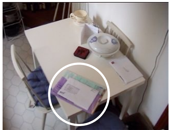
Display 3. Placing mail of relevance to others in general (corner of kitchen table).

The visibility of the practical character of mail allows the collector to make judgements as to the relevance of mail to the home and to household members. It is in this respect that members come to categorise certain mail as 'junk', to do so at-a-glance, and to respond to the categorisation by throwing the designated mail away. Junk mail is not always so easily spotted however, as categorisation is a matter of judgement rather than being given in advance. Consequently, the collector may open mail and browse through it to establish its relevancy status.