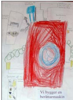
Early sketches of design ideas