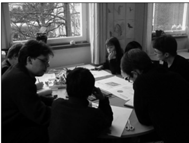
A design workshop