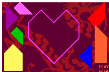
2-D rotation puzzle